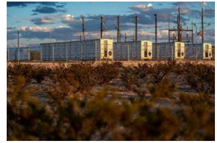
Swoose II 100 MW, 200 MWh