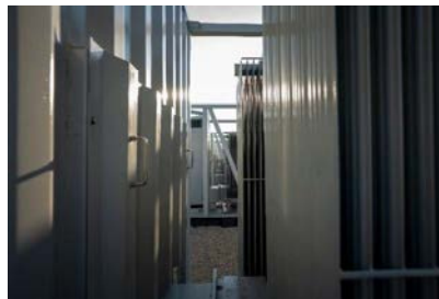
Flower Valley I 9.9 MW, 19.8 MWh