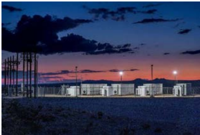
Tripe Butte I 7.5 MW, 15 MWh