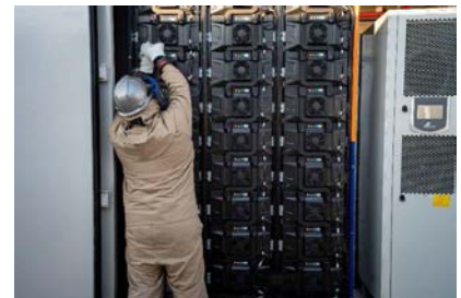
Swoose I 9.9 MW, 19.8 MWh

All material inside this deck is confidential. Please do not distribute without permission of Jupiter Power LLC.