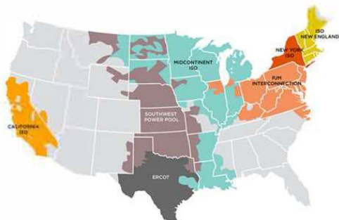
Map of Regional Transmission Organizations and Independent System Operators