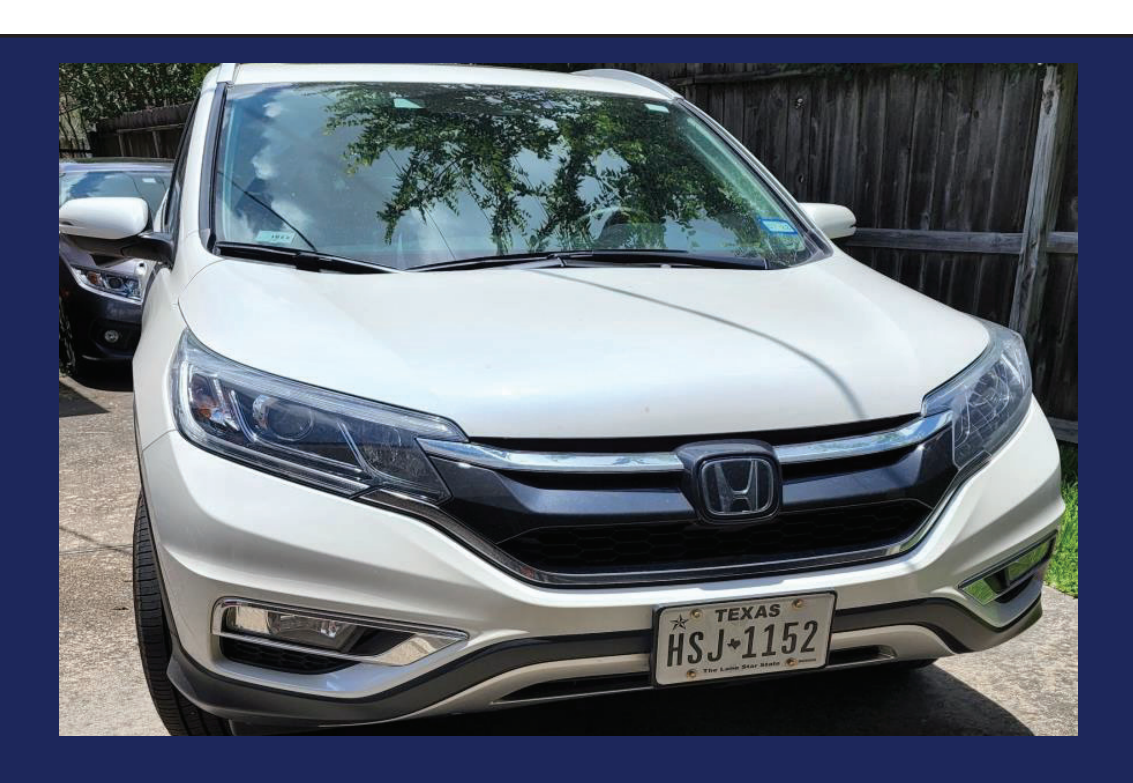
One of our vehicles.