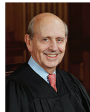
Stephen G. Breyer, Associate Justice