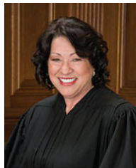
Sonia Sotomayor, Associate Justice