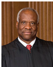
Clarence Thomas, Associate Justice