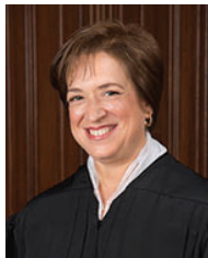
Elena Kagan, Associate Justice