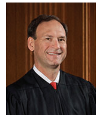
Samuel A. Alito, Jr., Associate Justice