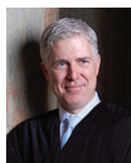
Neil M. Gorsuch, Associate Justice