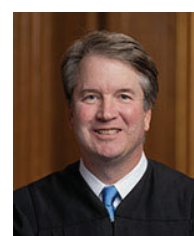
Brett M. Kavanaugh, Associate Justice