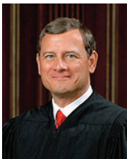
John G. Roberts, Jr., Chief Justice