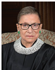
Ruth Bader Ginsburg, Associate Justice