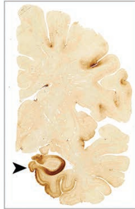
Stage III CTE