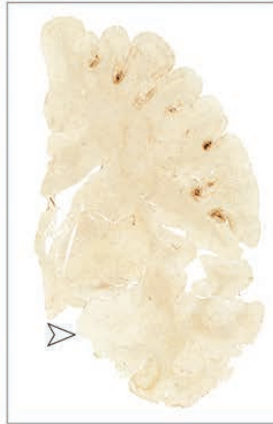
Stage II CTE