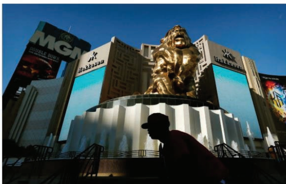
MGM Resorts International acknowledged that it was the victim of a data breach last year. A firm that monitors cybercrimes said 10.6 million people were affected.

Researchers have found 142 million personal details from former guests at the MGM Resorts hotels for sale on the Dark Web, evidence that a data leak from the hotel chain last summer may be far bigger in scope than previously thought.