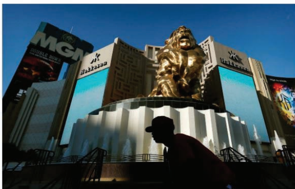
MGM Resorts International acknowledged that it was the victim of a data breach last year. A firm that monitors cybercrimes said 10.6 million people were affected.

Researchers have found 142 million personal details from former guests at the MGM Resorts hotels for sale on the Dark Web, evidence that a data leak from the hotel chain last summer may be far bigger in scope than previously thought.