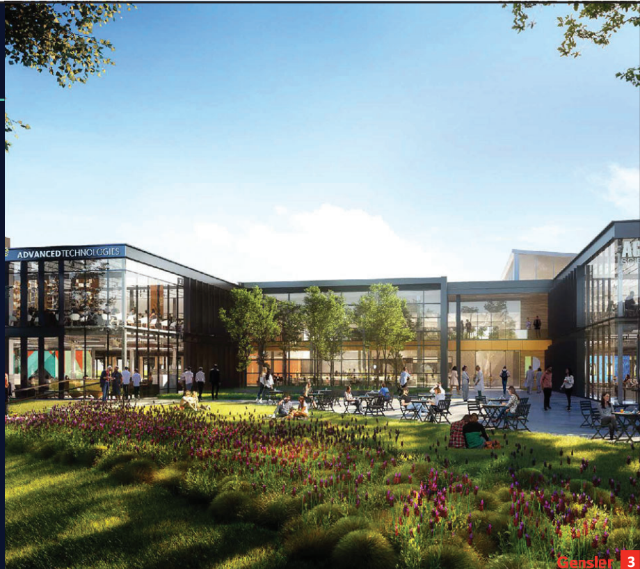
PARK POINT | DURHAM, NC

Life Science and Industrial continue to be the darlings for the recovery