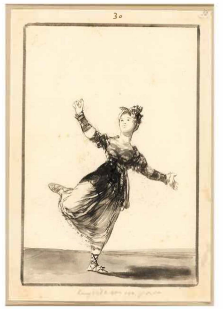
<u>Francisco José de Goya y Lucientes.</u> Be Careful with that Step! <u>1816–</u> <u>1820. The</u> Art Institute of Chicago.

Garcia v. Dial , 596 S.W.2d 524, 529 (Tex. Crim. App. 1980) (citations omitted)