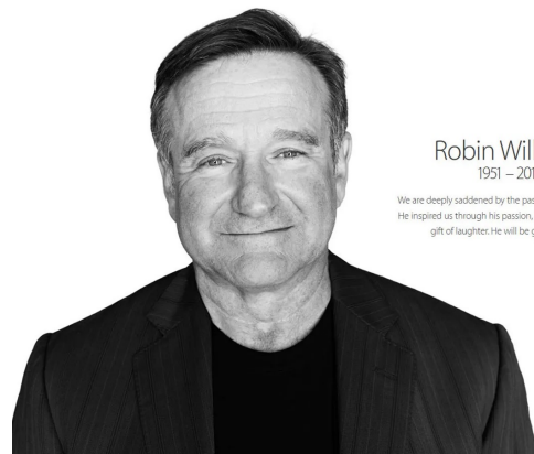
Robin Williams 1951 – 2014

We are deeply saddened by the passing of Robin Williams. He inspired us through his passion, his generosity, and the gift of laughter. He will be greatly missed.