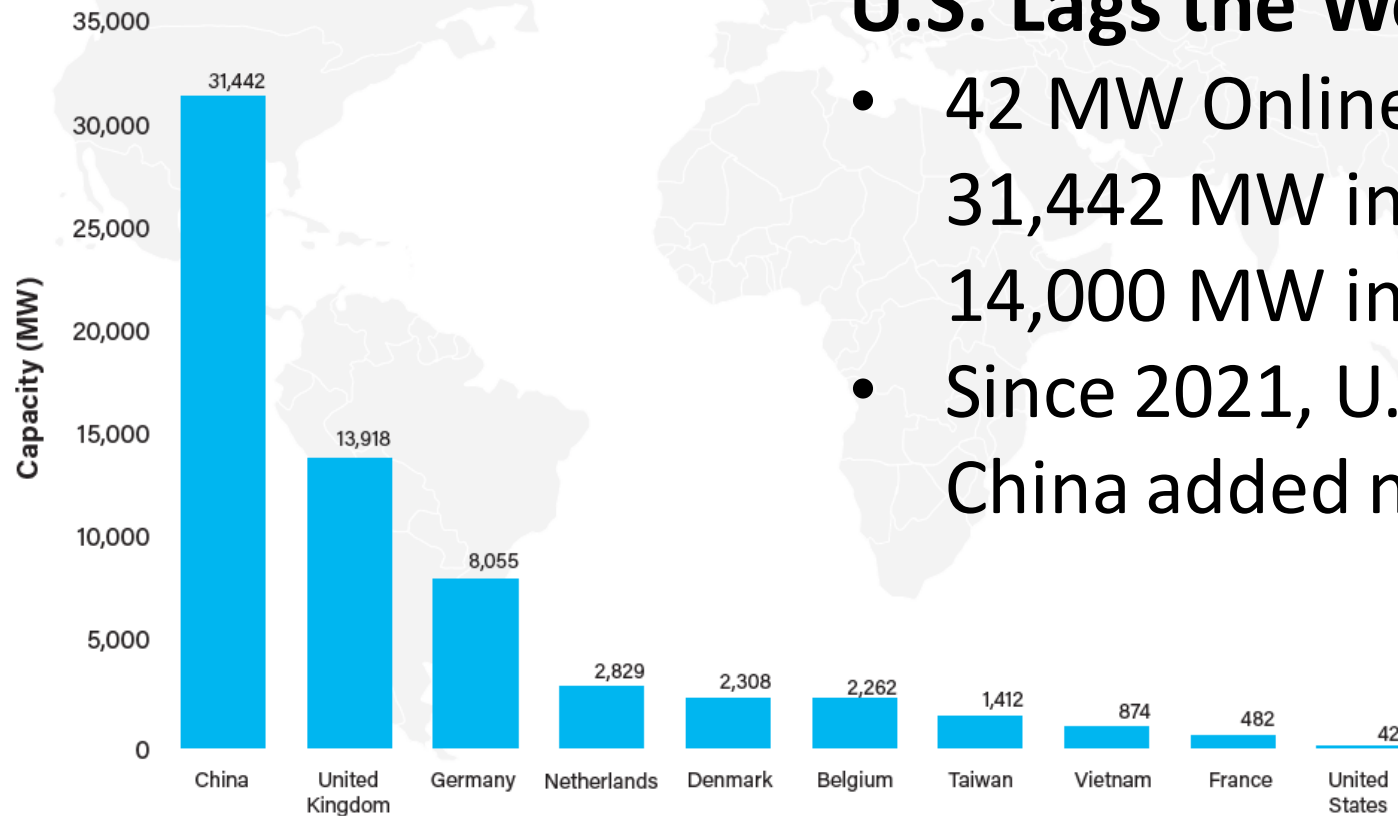
U.S. and Global Installed Offshore Wind Capacity, 2022