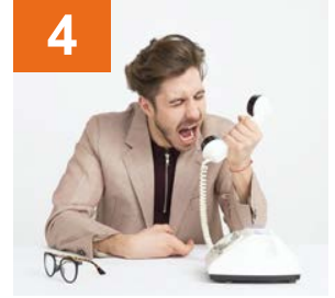
Handling Client Complaints